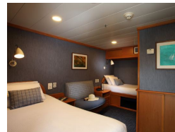
Classic Family Cabin