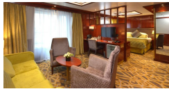
Explorer Deck Owner's Balcony Suite