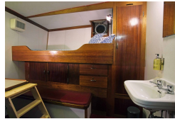
Double Cabin En-suite