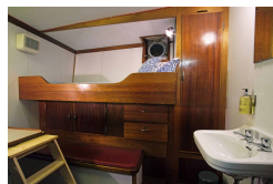
Double Cabin En-suite