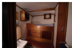
Single Cabin En-suite