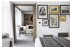
Prestige Stateroom - Deck 4