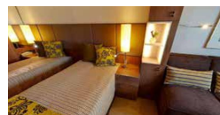
SUPERIOR CABINS DECK 5