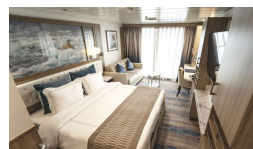
Balcony Stateroom - B