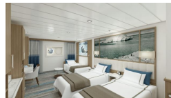
Balcony Stateroom Category A