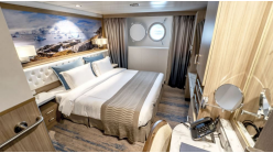
Balcony Stateroom - A Balcony Stateroom - B Balcony Stateroom - C Balcony Stateroom Category A Balcony Stateroom Category B Balcony Stateroom Category C Balcony Stateroom Superior Captain's Suite Captain's Suite Junior Suite