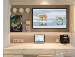
Suite A Solo