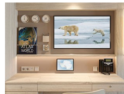
Suite B Solo