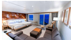
Bridge Deck Balcony Stateroom