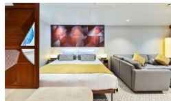
Bridge Deck Balcony Suite