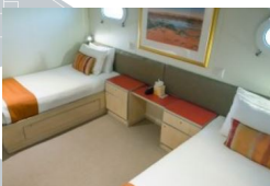
True North II - River Class - Double