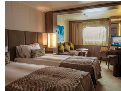
Deck 5 Superior