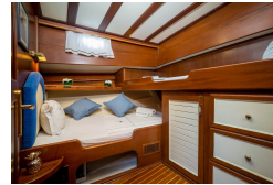
Full Ship Charter