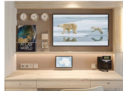
Suite B Solo