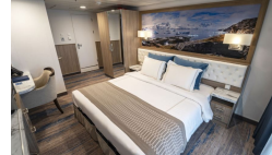
Balcony Stateroom Superior Captain's Suite