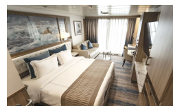
Balcony Stateroom - B