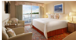
Standard Balcony Cabin