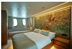
Above Deck Cabin