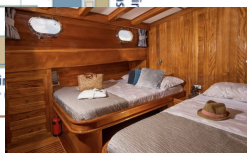
Grand Master cabin (only on Flas VII)