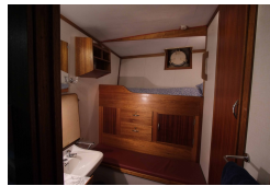
Single Cabin En-suite