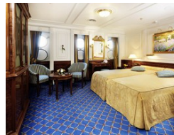
Category E. From