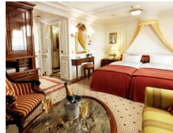
Category C. From