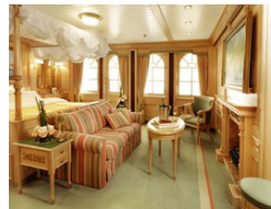
Category B. From