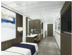
Aurora Stateroom Triple