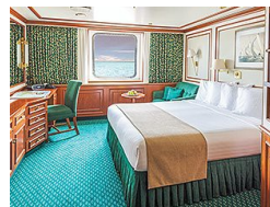
Category 3 Solo