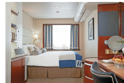
Cabin category BX deluxe Category A

Bridge Suites: 495 square feet (46 square meters) Officers' Suite: 242 square feet (22.3 square meters), 1 bathroom Suites: 376 square feet (35 square meters), 2 bathrooms Staterooms: 188 square feet (18 square meters) Staterooms with 3 rd Berths: 137-140, all suites Staterooms with One Queen Size Bed Only (no two options): 101, 102, 157, 202, 204, 269, 301-302, 303-304