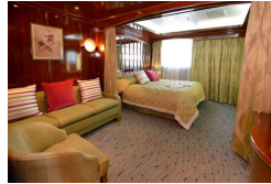
Byrd Deck Superior Suite