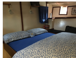
Twin Cabin En-suite