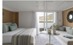
Grand Deluxe Suite