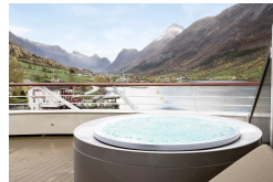
Prestige Stateroom Deck 4