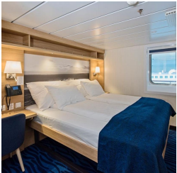
Expedition Suite. From