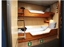
Twin Private Porthole - Waitlist