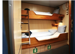
Twin Private Porthole - Waitlist