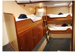
Twin Private Inside - Waitlist