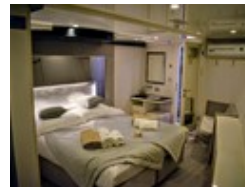
Main and upper deck cabin