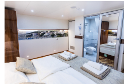
Lower deck cabins