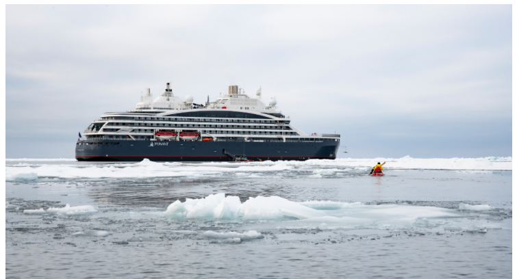
Zodiacs on board.

our Hospitality & Travel Manager officer, Our boutique which sells clothing, jewellery, beauty products, postcards and various accessories, The image & photo desk. The different lounges include a 302 m 2 main lounge including a 28 m 2 cigar lounge, a tea corner and a bar, with live music on selected evenings, A 400 m 2 panoramic bar and lounge, An open-air Bar. The recreation spaces Fitness & Beauty Corner: Fitness room: Elliptic, running machines, bicycles... Beauty Corner: Hairdresser, Massage rooms, Sauna, Snow Room, Nail Shop. Pool area: Indoor Pool and winter garden - Outdoor Pool Theatre: Capacity: 270-276 - Main show room for conferences and live entertainment on selected evenings - State-of-the-art audio and video technology. Leisure area: Public areas - Library - Medical centre. 16