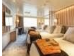
Explorer Suite. From