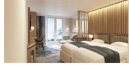
Explorer Triple. From