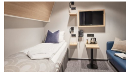
Junior Suite with Balcony. From