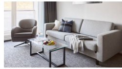
Seaview Superior. From