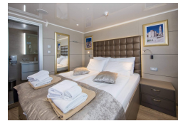
Upper Deck VIP Cabin