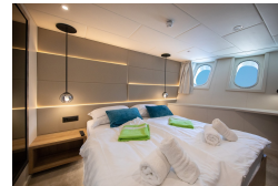
Upper Deck VIP Cabin