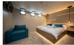
Upper Deck VIP Cabin