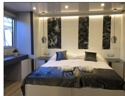
VIP Cabin with Balcony