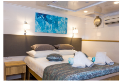
Lower deck cabin