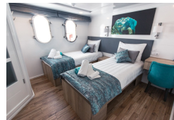
Main/upper deck cabin