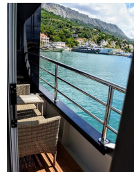
Upper deck balcony cabin