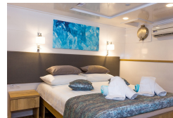
Lower deck cabin