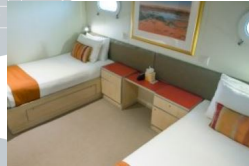
True North II - River Class - Double