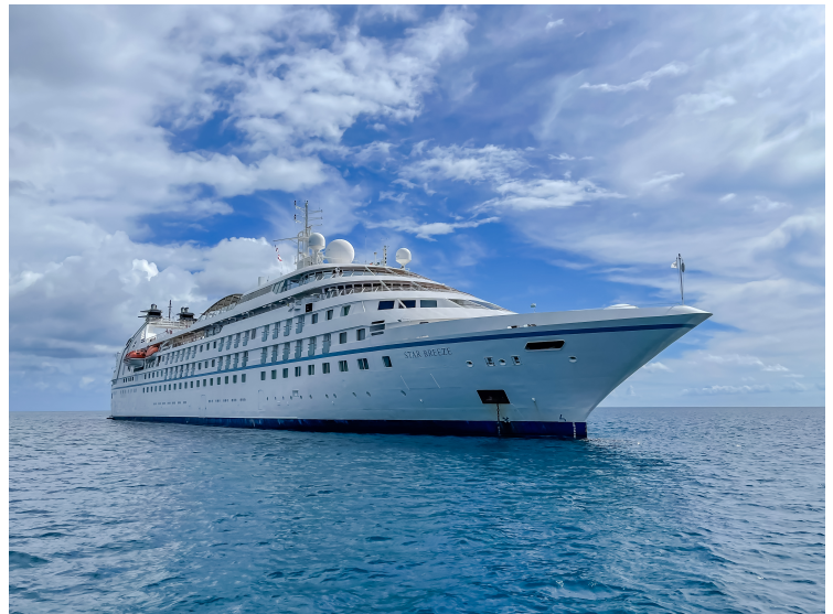
mirror and chair

Star Breeze, Star Legend & Star Pride are large enough to pamper and entertain you, yet small enough to tuck into delightful harbours and hidden coves that others can't reach. These all-suite yachts completed a renovation as part of the $250 Million Star Plus Initiative to provide more of what guests love. New public areas, including two new dining venues, a new spa, infinity pool, and fitness area. The yachts also boast all new bathrooms in every suite and a new category of Star suites, featuring a new layout. With ocean views and at least 277 square feet of comfort, Star Breeze, Star Legend & Star Pride are the perfect yachts to watch glaciers and fjords drift by from the serenity of your suite. Carrying only 312 guests, Star Breeze, Star Legend & Star Pride still tuck into small ports like Sanary-sur-Mer and Wrangell or narrow waterways like the Corinth Canal and Keil Canal. These ships include 156 suites, including 4 Owners' Suites, 2 beautiful Classic Suites, 3 Deluxe Suites, 79 Ocean View Suites, 58 Balcony suites, and 10 Star Porthole Suites. All Accommodations Feature Queen Size Bed with Luxurious Linens Waffle Weave Robe and Slippers Interactive TV Fully Stocked Mini Bar/Refrigerator Safe Direct