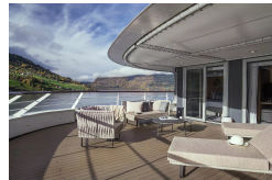
Grand Deluxe Suite