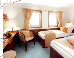
Category 3. From