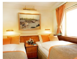
Category 5. From