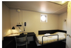
Premier Single ■