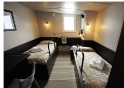
Premier Twin ■