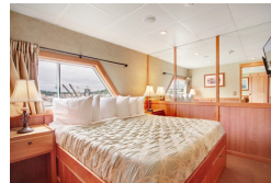
Jr Commodore Cabin