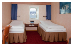
Cat 4 - Twin