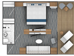
Category B Suite - Balcony Suite