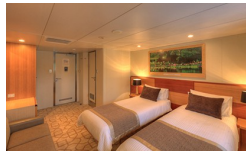
Promenade A Stateroom