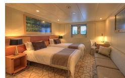
Main Deck B