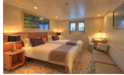
Main Deck B Stateroom