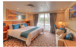
Bridge Deck Balcony Stateroom