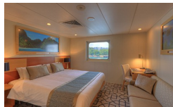
Promenade B Stateroom