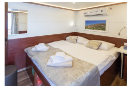
Lower Deck Cabin Single