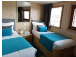
Upper Deck cabin with Terrace