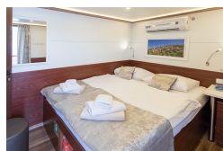
Lower Deck Cabin Single