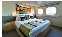
True North II - Explorer Class - Stateroom