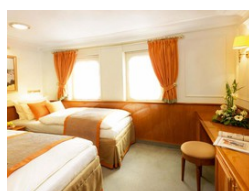
Category 4. From