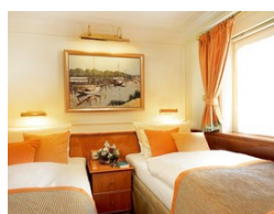
Category 5. From