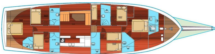
Double or twin cabin